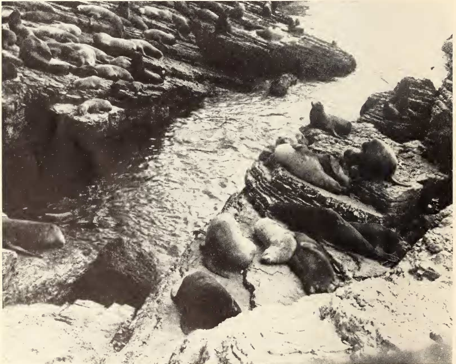
Fig. 3. California sea lion bulls hauled out next to Steller sea lion cows and pups. The Steller sea lion cows are light in color in contrast to the California Bulls. Some pups are to be seen on the ledge in the upper left part of the picture. Año Nuevo Island, California, September 7, 1963

As the Steller pups grow they move from the small tidepools in the rookeries into the sea where they swim and play in the surge channels and in areas between the rocks off the seaward side of the island. This sort of behaviour reaches its peak in late September, at which time the California male sea lion population is at its peak. The pups do much leaping out of the water onto rocks in the process of chasing each other and disturb many resting California bulls. The bull will usually raise his head, turn his neck and open his mouth as the pups race over his back but has never been seen to harm them in any way.